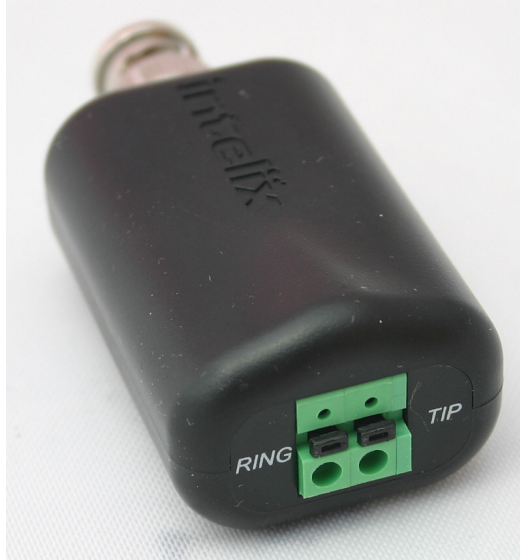
Video Balun Connectors