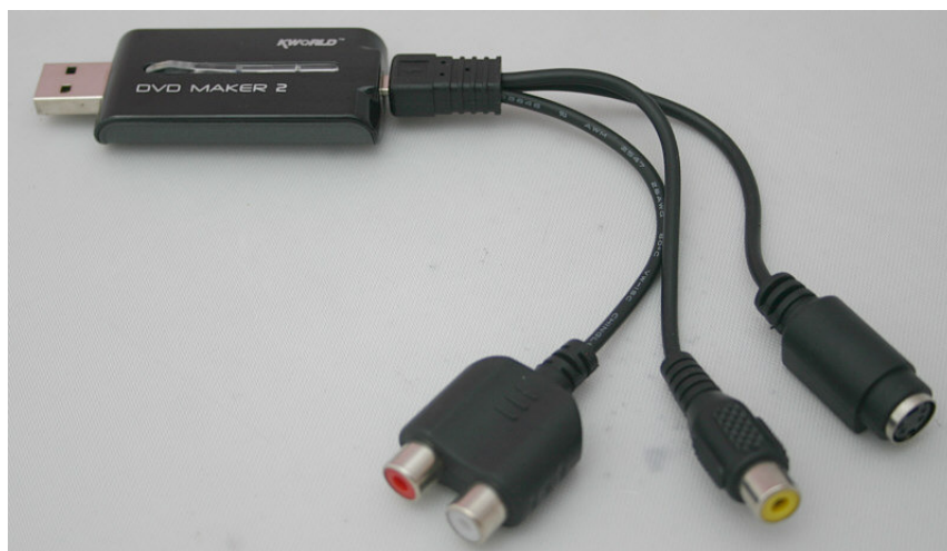
DVD Maker 2