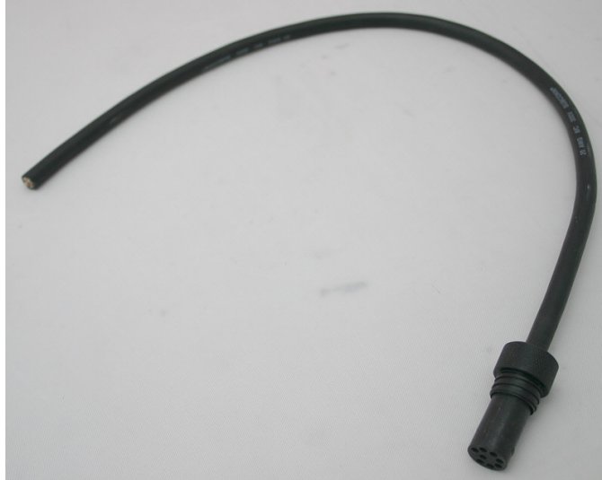
Female Tether Connector and Whip (Qty 2) (includes locking collar)

See the parts list and circuit diagram at the end for additional information.