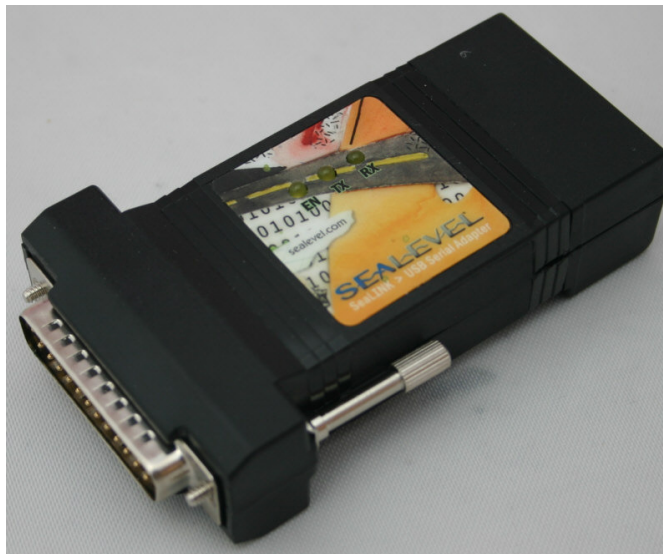
Sealevel RS-485 – USB Converter